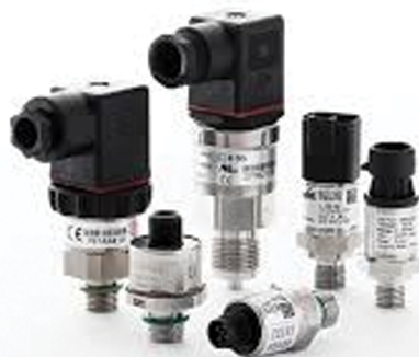
Pressure Transmitter without Display