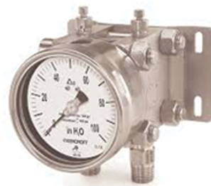
Differential Pressure Gauges