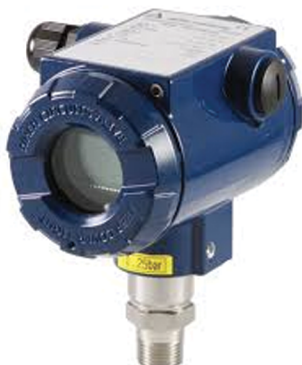
Diaphragm Pressure Transmitter with Display