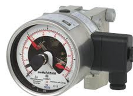
Differential Pressure Switch