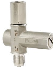
Transmitter Overpressure Protector