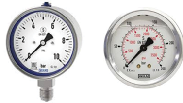
Dry Pressure Gauge

Oil, Gas, and Petrochemical Industries Chemical Industries Food and Pharmaceutical Industries Water and Wastewater Industries